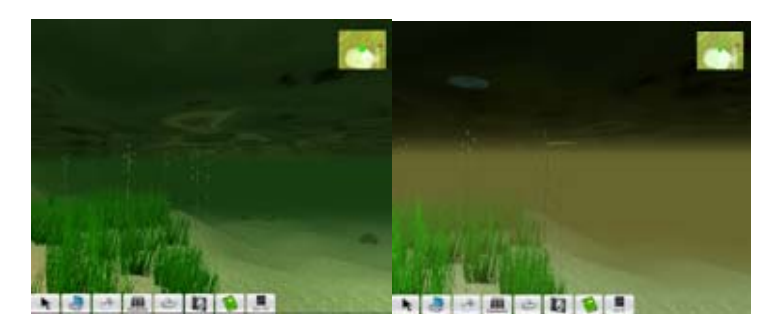
Figure 3: Visual Changes in Turbidity of the Pond on Different Days